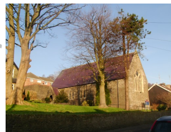
St David's Church, Wyndham CF32 7HE

(and part of 'Y Pedair Afon' Ministry Area)