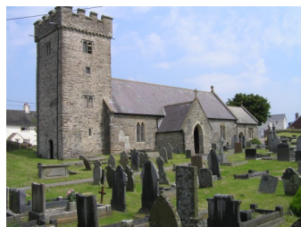
St Tyfodwg's Church, Glynogwr CF35 6EL